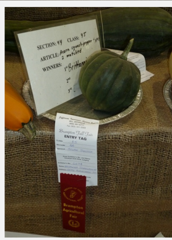
Prize winning produce